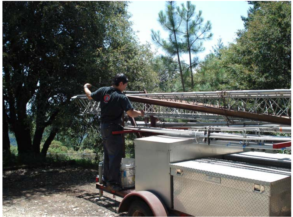
Yin Shih, N9YS, begins deploying the 65' tower mounted to a trailer used to elevate HF antennas.