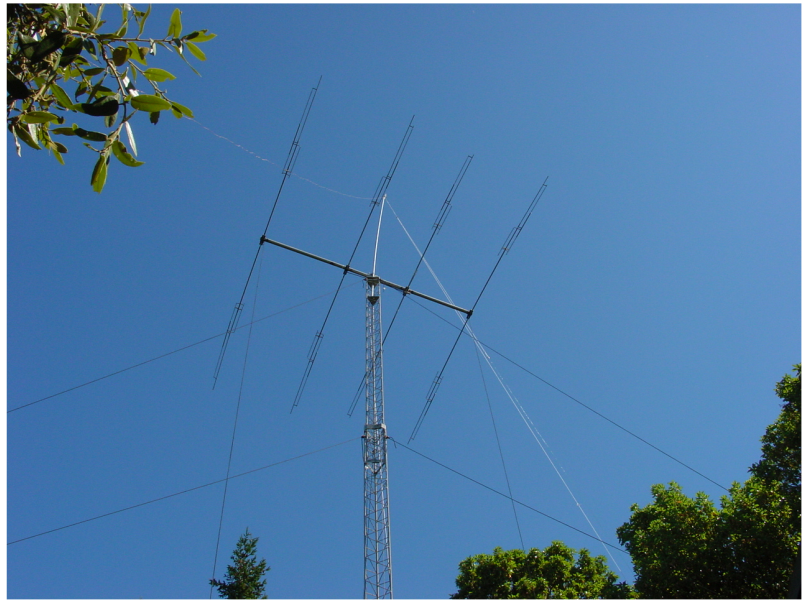
Field Day 2005 at Castle Rock State Park - A beam antenna at 55' above ground. SARA members do all preparations including equipment set-up and break-down.